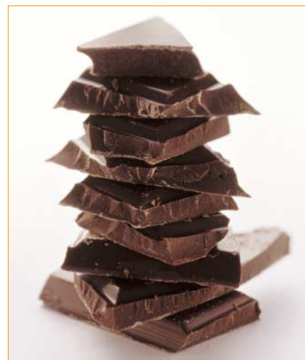
Figure 1 Stack of benefits? Unlike its milky counterpart, dark chocolate may provide more than just a treat for the tastebuds.

Addition of milk, either during ingestion or in the manufacturing process, therefore inhibits the in vivo antioxidant activity of chocolate and the absorption into the bloodstream of (–)epicatechin. This inhibition